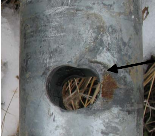
Conventional Pipe Piles - Elongated/torn holes with round pipe pile coupling & bolts in shear.