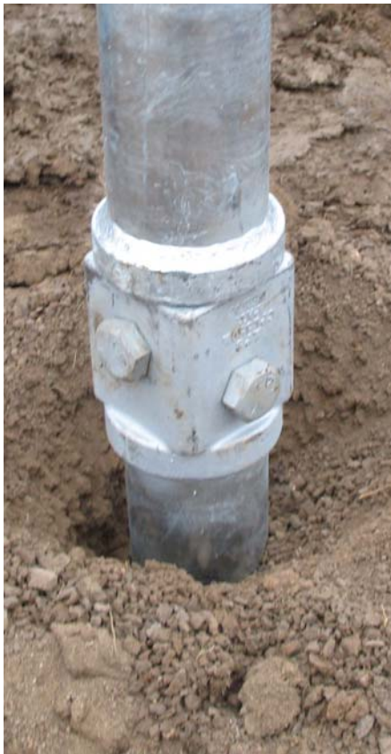
2-bolt Cross Connection