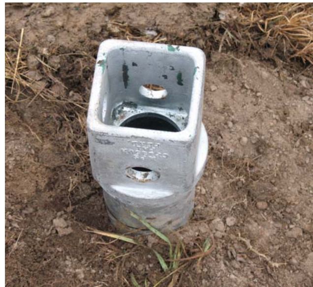
Pipe pile and coupling system remains undamaged during installation